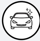
Clean & Degrease Cars, Trucks & Motorcycles