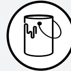
Thin Stain, Shellac & More