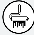
Thin Paint & More