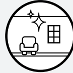
Clean Walls & Tile