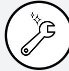
Clean & Degrease Tools