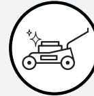
Clean & Degrease Small Engines & More