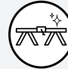
Clean & Degrease Floors & Surfaces