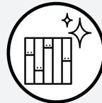
Clean Decks & Siding