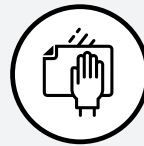
Remove Tough Stuff