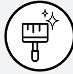
Clean Up Paint